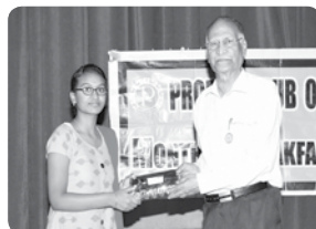
Children Day prize given