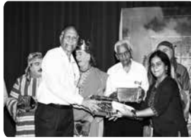
President felicitates director actors and prompter