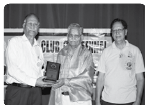
Elders Day memento recd