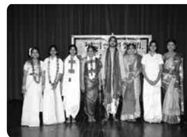
MOP vaishnav group