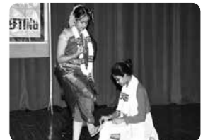
MOP Vaishnav marriage- Ritual TNadu