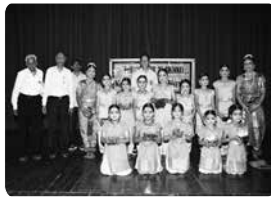
Tryambika School of Natya troupe