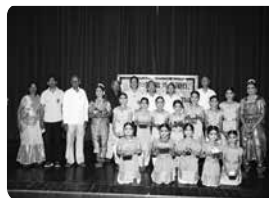
Dance troupe with Office bearers and Donors