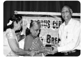
President felicitate Vishranthi dancers