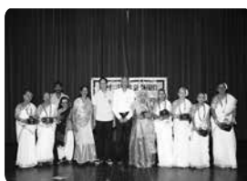
Dance group from Anandham Home inmates