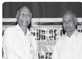
Rangaramanujam recd Bday gift