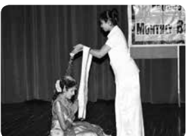
MOPV Marr Ritual Kerala