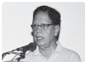
Secretary gives vote of thanks