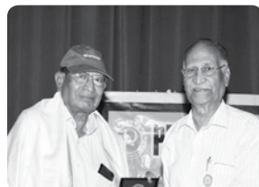
Elders Day memento received