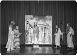
A scene from drama Julius Caesar