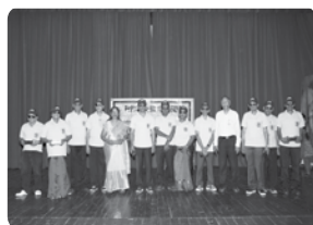
Zumba Dance Group with President and Choreographer