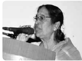
VP Cultural Day Organiser briefs on programme