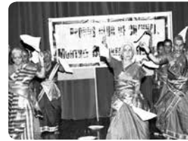
Dancers who are inmates of Vishranthi 80 plus ladies