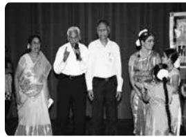
Dance group youngest and Oldest with VP