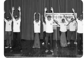
Zumba dance in progress