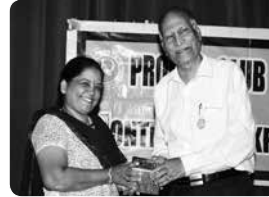
Drama prompter receives memento