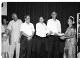
Dance group appreciated