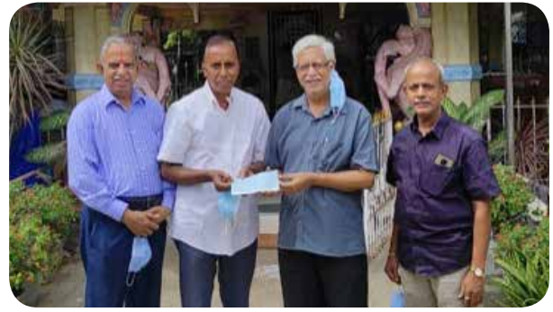
On 09.02.22 ₹10,000 was donated on behalf of our club to the Sri Sathyanarayana Charitable Trust, Nanmangalam and Donated for Corona Relief. They are running a old age home as a free service to deserving senior citizens.