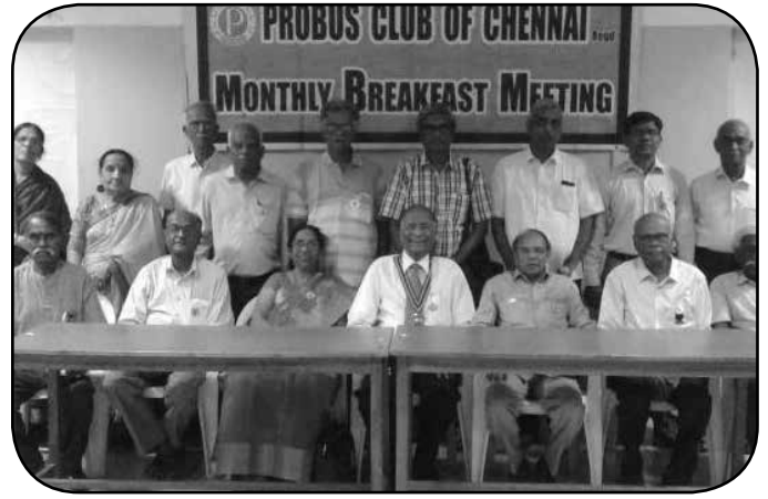
New Office-bearers and EC Members