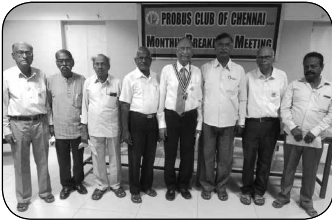
Members of Probuc Club of Cheyyar.